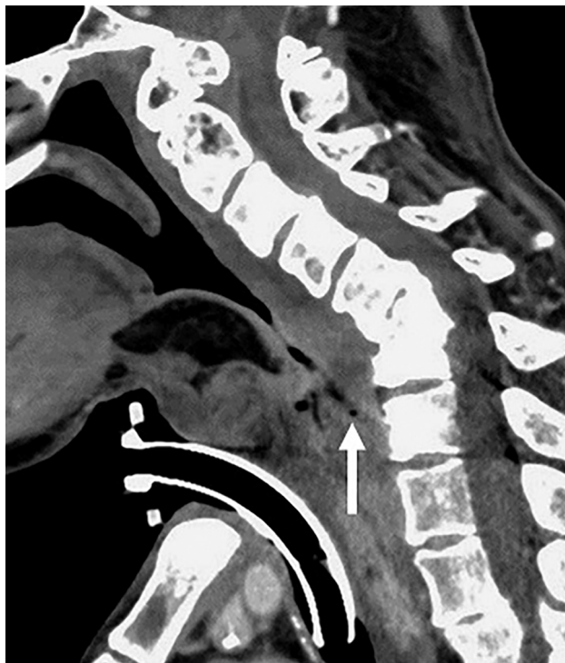
FIG 1. A 51-year-old man with a history of laryngeal SCCA, treated with total laryngectomy and myocutaneous flap reconstruction. Sagittal contrast-enhanced CT demonstrates marked prevertebral soft-tissue thickening from C4 to T1 and chronic fracture/dislocation at C6–C7. A bulky myocutaneous flap reconstructs the anterior pharyngeal wall; note how lumen tapers, terminating at C7. A tiny locule of extraluminal air is present in the prevertebral soft tissues just anterior to the T1 superior endplate (arrow).