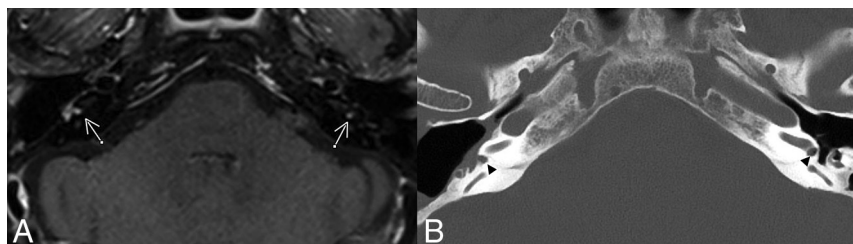
FIG 1. Example of enhancing granulation tissue in the RW. A, Axial postcontrast FS T1WI demonstrates enhancement present bilaterally in the RWs (arrows). B, Axial head CT with thin-section bone window reconstructions demonstrates a right-sided canal wall-down mastoidectomy for resection of a cholesteatoma. Opacification of the round windows can be seen bilaterally, correlating to the area of enhancement (arrowheads).