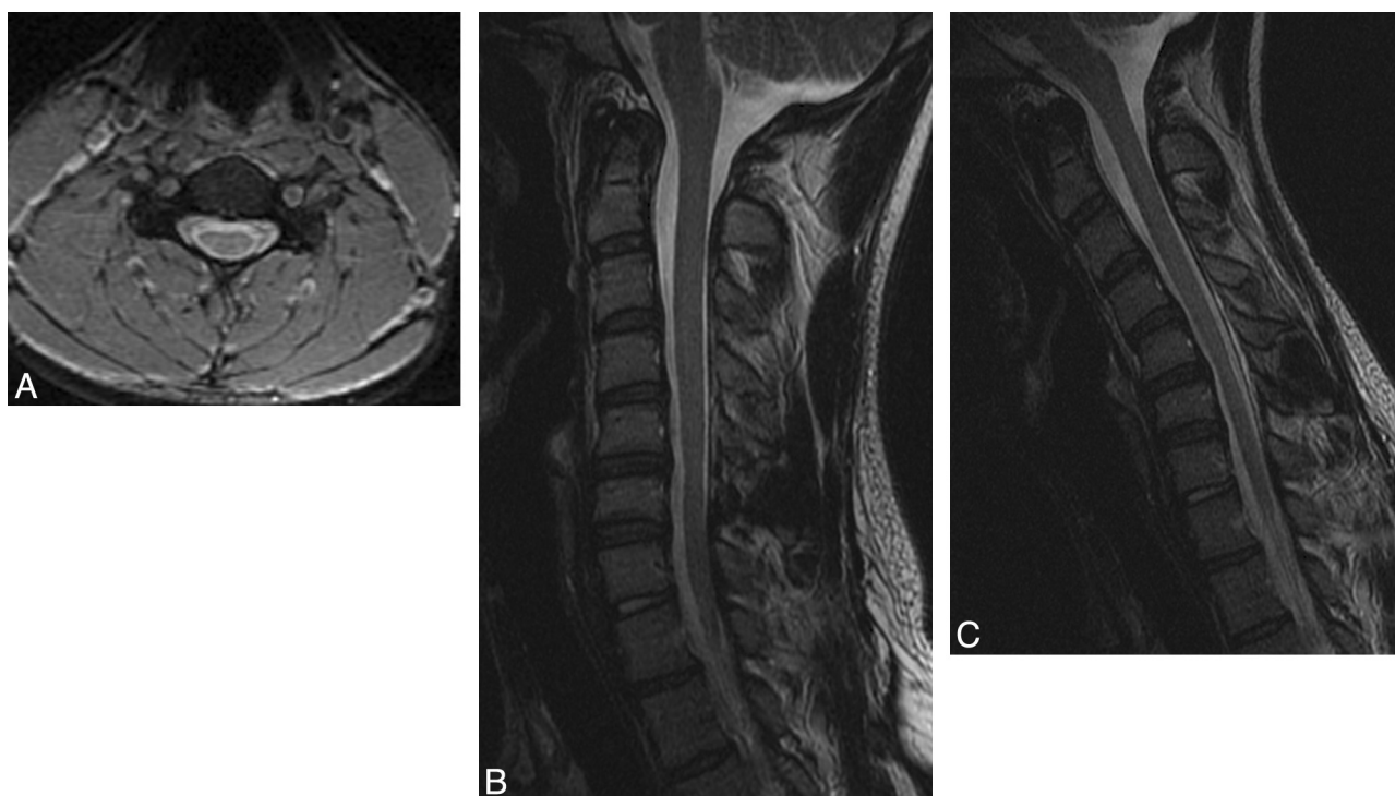
Fig 2. A 20-year-old man with HD. A , Neutral axial gradient-echo image at the C5 level demonstrates subtle bilateral LOA along the lateral aspects of the lamina bilaterally and spinal cord atrophy, asymmetric to the right. B , Neutral sagittal T2-weighted image also localizes this atrophy to C5-C6. C , Flexion sagittal T2-weighted image demonstrates 2 mm of anterior dural shift. The posterior subarachnoid space is not completely obliterated, and there is no direct spinal cord compression.

severe or very severe involvement (rated 3 or 4 on a 4-point scale) and the presence of LOA were each significantly more likely in patients with HD (Table 2). The difference of spinal cord T2 hyperintensity, asymmetric cord flattening, and abnormal spinal curvature between the 2 groups was not statistically significant.