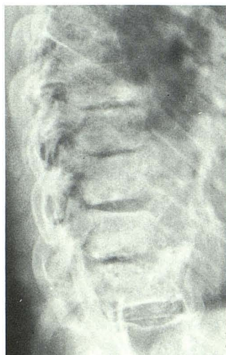
Fig. 2. —Charcot spine, case 2. Radiograph 34 years after injury shows that peridiskal portions of T11 and T12 vertebral bodies have been destroyed, and that subjacent bone is dense. Early neuropathic changes are seen at higher spinal levels.

Feldman et al. [4] pointed out several other difficulties in the radiographic documentation of neuropathic disease of the