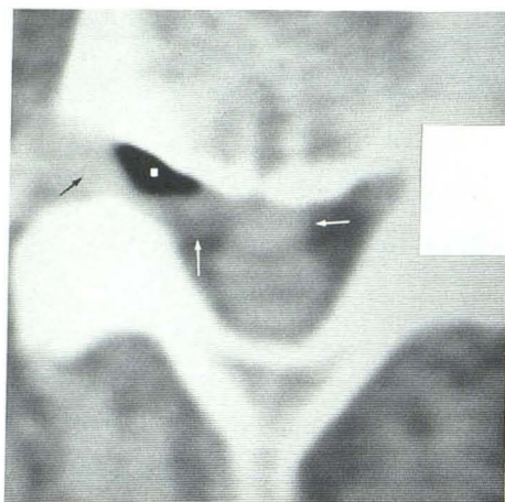
Fig. 2.—Large midline mass behind vertebral body extending to right side, obstructing neural foramen (arrows). Density measurements within mass (65 H) were typical of disk material. Large gas collection within herniated disk material (−943 H). Dura is displaced posteriad; extradural location of hernia is obvious.

tion, and density, partially surrounded by metrizamide (fig. 1C). The gas collection appeared to be connected to an underlying soft-tissue mass (density 20–30 H) (fig. 1D). This was presumed to be a disk fragment with relatively low attenuation resulting from partial-volume averaging.