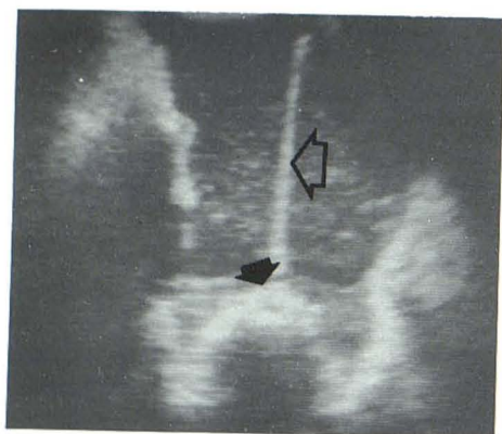
Fig. 1.—Case 1. Transverse intraoperative sonogram of L4–L5 laminectomy site. Microbubbles in saline bathe dural sac. Metal cannula ( open arrow ) demarcates dural interface ( solid arrow ), which is thickened and impedes acoustic signal to further through-transmission.

Initially, microbubbles were prominent in the water bath of the surgical site, but after a few minutes they resorbed to produce a clear space above the dural sheath. It was not necessary to actually put the transducer on the dural sheath