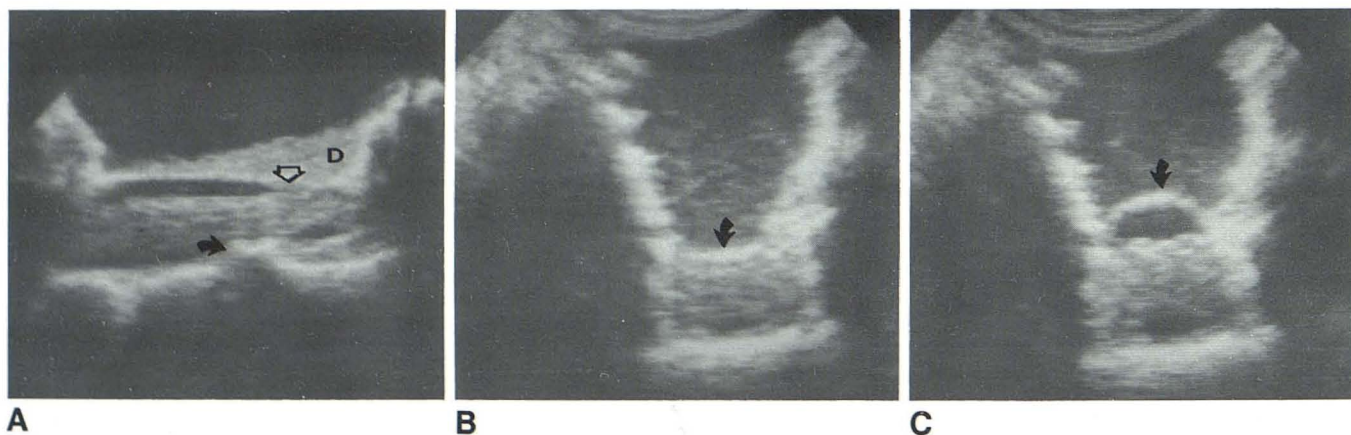
Fig. 2.—Case 2. A , Longitudinal intraoperative sonogram after lumbar laminectomy defines some narrowing of dural sheath posteriorly by thickening secondary to arachnoiditis ( open arrow ) and anteriorly by mildly protruding disk at L4–L5 with associated osteophytic spurring ( closed arrow ) causing acoustic shadow just inferior to disk. Some layering of debris ( D ) along the posterior surface of dural sac. Arachnoiditis suspected on CT by clumping of nerve roots

Irregular thickened fascia was identified over a prior laminectomy site (fig. 3C). In case 2, when L2–L3 had been exposed before further resection at L4–L5 and L5–S1, the fluid-filled dural sac markedly expanded during the anesthetist's manipulation of deep inspiration for a Valsalva-like maneuver of the patient (fig. 2C). Thereafter, with expiration, the dural sac decompressed with rest (fig. 2B). After decompres-