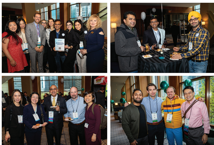
FIG 5. Selected photos from Monday evening's Committee Orientation and Meet-Up Reception.

Barisano discussed approaches to perivascular space quantification and the associated clinical relevance, and Meng Law outlined the various disease states for which the perivascular spaces and glymphatics have implications (eg, neurodegeneration, traumatic brain injury, stroke, epilepsy, sleep apnea, coronavirus disease 2019 [COVID-19], and demyelinating and autoimmune diseases).