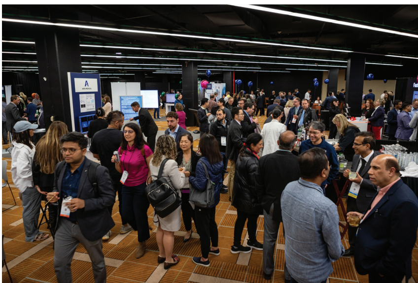
FIG 3. Attendees socialize with friends and colleagues in the exhibit hall while also having the opportunity to visit with meeting exhibitors during the Opening Reception and Reunion Night.