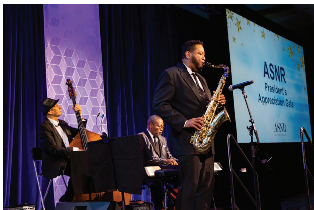
FIG 6. Local Chicago musicians providing live music at Tuesday evening's President's Appreciation Gala.