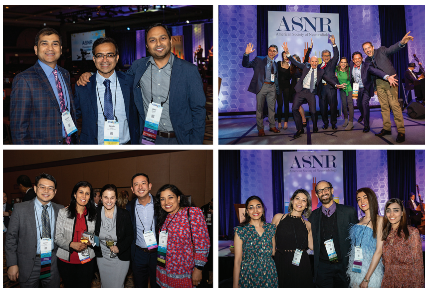
FIG 9. Selected photos of attendees at Tuesday evening's President's Appreciation Gala.

Additional sessions will focus on psychiatry ("Toward Personalized Measures of Psychiatric Disease Using Advanced Neuroimaging"); novel technologies, such as photon-counting CT and magnetic particle imaging (a new noninvasive imaging method that detects iron oxide nanoparticles to produce 2D and 3D images, more sensitive and substantially faster than MR imaging or PET); and virtual reality. ASNR 2024 will also again highlight study groups for DTI/fMRI, PET, and vessel wall imaging.