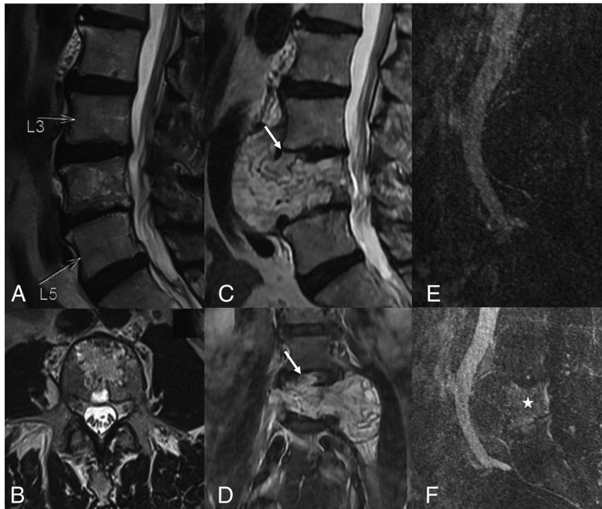
FIGURE. The T2 sagittal (A) and axial (B) MR images done in December 2017 show a nonexophytic and centrally located T2 hyperintense lesion, confined to the L4 vertebral body outline without any extraosseous soft tissue. Repeat T2 sagittal (C) and coronal (D) MR imaging in August 2020 shows increase in the size of mass. The mass is centered within the body of vertebra with an exophytic component extending to the left lateral aspect causing smooth displacement of the psoas major muscle. Note the focal areas of infiltration of adjoining intervertebral disc ( white arrows ) by the tumor. The sagittal dynamic TRICKS MR image arterial phase (E) shows no early enhancement or any dominant feeder to the mass. The venous phase of angiogram (F) shows mild diffuse tumoral enhancement of the lesion.