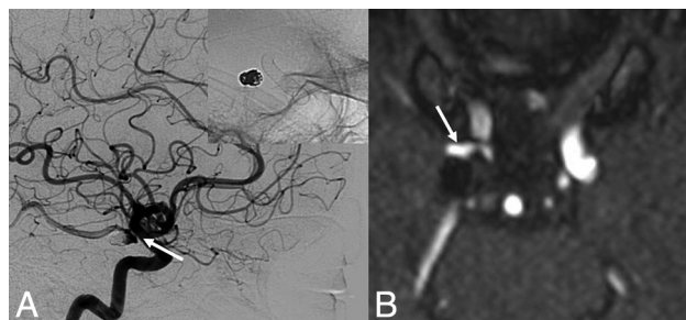
FIG 2. Aneurysm persistence after flow diversion. A 67-year-old woman who had a previously ruptured right posterior communicating artery aneurysm with evidence of recanalization on the 6-month follow-up angiogram. She was treated with flow diversion for the neck recurrence. A 6-month follow-up DSA (lateral x-ray) after flow diversion demonstrates class C OKM grade (continued filling at the neck of the aneurysm) (white arrow). At last clinical and angiographic follow-ups at 3 years, there is no evidence of aneurysm rerupture or progression of the neck remnant on MRA (white arrow).

zed aneurysms. In addition, high rates of aneurysm occlusion and durability of treatment 6 make studying aneurysm remnants after flow diversion difficult. Therefore, the natural history of this entity is ill-defined. Our study emphasizes the importance of adjunctive coiling and overlapping devices when appropriate to achieve higher rates of occlusion on midterm imaging follow-up. Moreover, we find that the clinical impact of aneurysm remnants after flow diversion is benign, with no evidence of rerupture in our cohort.