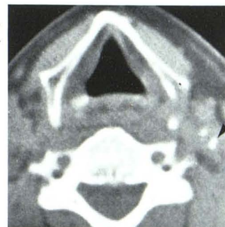
Fig. 3.—CT scan at level of angiographically located carotid artery stenosis. Localized calcification (arrow).

course be selected. The technical skill of the radiologist in manipulating introducers, wire-guides, and catheters is also of the utmost importance for a successful outcome.