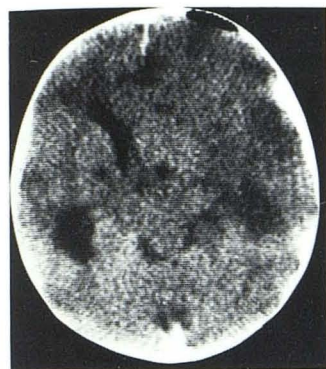
Fig. 2.—CT (A) and BAERs (B). Left cerebral contusion, brainstem rotation, and contralateral temporal horn dilatation. Interpeak latency of wave I-V is more than 4.48 msec (grade 3).