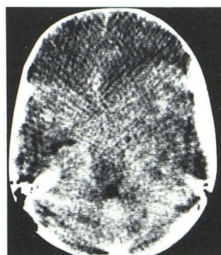
Fig. 1.—CT (A) and BAERs (B). Left extradural hematoma, obliteration of basal cisterns, and contralateral temporal horn dilatation. Interpeak latency of wave I–V is not more than 4.48 msec (grade 2).

Click signals (0.1 msec impulses of alternating polarity) were presented monaurally through electromagnetically shielded earphones at an intensity of 110 dB peak-equivalent sound pressure level (which corresponds to 80 dB hearing level) and at a rate of 21/sec. BAERs were recorded from conventional electroencephalographic (EEG) electrodes (vertex–ear lobe), amplified \times 10^5 at a