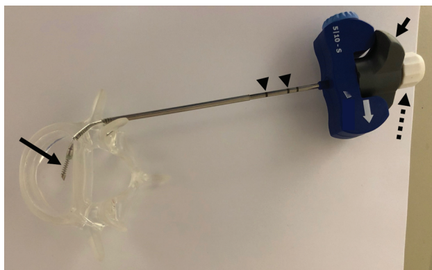
FIG 1. Navigational bipolar radiofrequency ablation electrode. The targeted multidirectional distal tip of the electrode ( large arrow ) can be articulated up to 90° by turning the gray knob ( small arrow ) on the handle in the direction of the printed white arrow on the handle. Laser etchings ( arrowheads ) along the device shaft mark the exit point and deployment point of the electrode from the introducer cannula. After desired positioning within the nidus, the RF electrode tip is fully extended by turning the white knob ( dotted arrow ) at the handle. There are 2 active thermocouples embedded within the electrode located 5 and 10 mm from the center of ablation zone, which allow precise real-time monitoring of ablation zone volume and geometry.