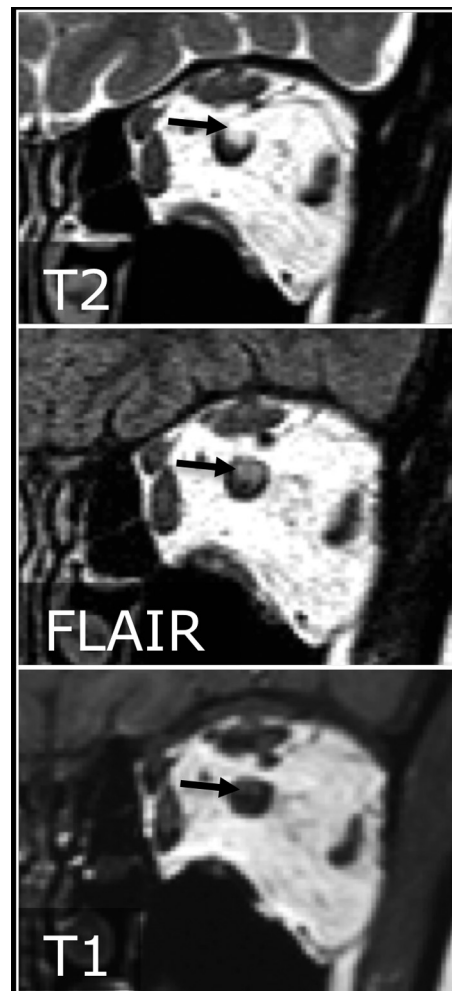
FIG 1. High-resolution MR images of a paraoptic cyst. The cyst is superolateral, causing a mass effect on the optic nerve, which is displaced inward and inferiorly. The content of the cyst appears hyperintense on T2WI and moderately hyperintense on FLAIR and T1WI.

Statistical Analysis. Data gathering and analysis were performed by A.B. Given our small sample size, only nonparametric tests were used in this study. MD, PSD, and OCT values were compared between the side of the cyst and the opposite side in the 8 patients with unilateral cysts; and available visual field tests and OCT, by using the Wilcoxon matched pair test. Arterial resistance indices were compared between the side of the cyst and the opposite side in the 7 patients who had a unilateral cyst and available US imaging, by using the Wilcoxon matched pair test. Correlation between the size of the cysts on the one hand and the indicators of glaucoma severity on the side of the cyst on the other hand (MD and PSD on visual field, thickness of the nerve fiber layer on OCT) was assessed by using the Spearman correlation coefficient.