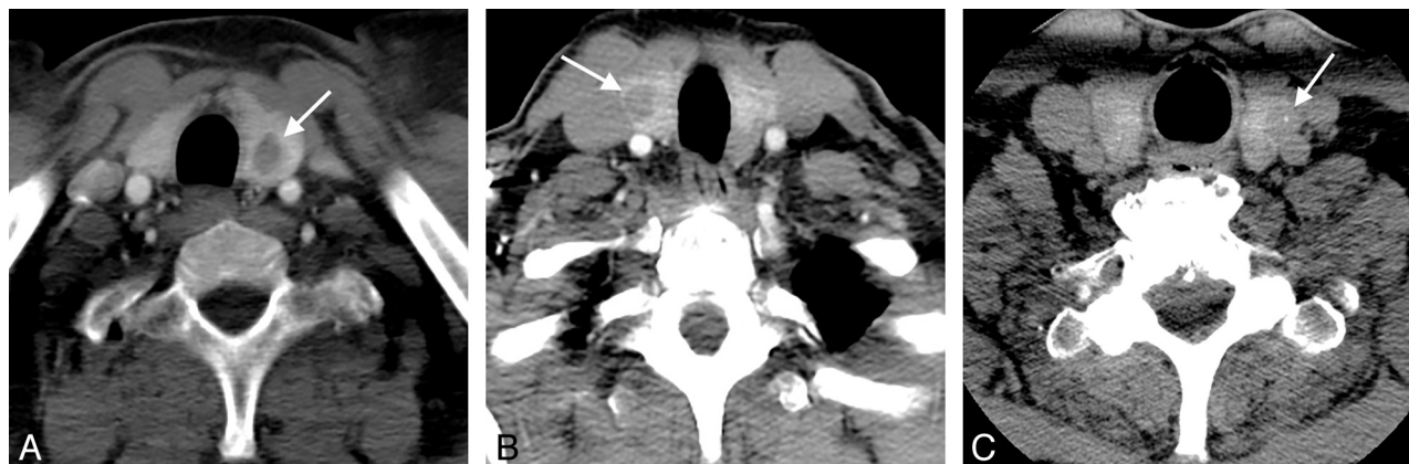
FIG 3. Three patients with incidental thyroid nodules that were similar in size but were reported differently. A , A 46-year-old man with a 12-mm incidental nodule in the left thyroid lobe detected on chest CTA performed to evaluate an abdominal aortic aneurysm. The nodule was reported only in the “Findings” section of the report without a recommendation. B , A 47-year-old woman with a 10-mm incidental nodule in the right thyroid lobe detected on chest CTA performed to evaluate chest pain. The nodule was reported in the “Impression” section without a recommendation. C , A 63-year-old man with several incidental thyroid nodules detected on cervical spine CT performed to evaluate neck injury. The largest was in the left thyroid lobe and measured 10 mm. The nodule was reported in the “Impression” section with a recommendation for sonography.