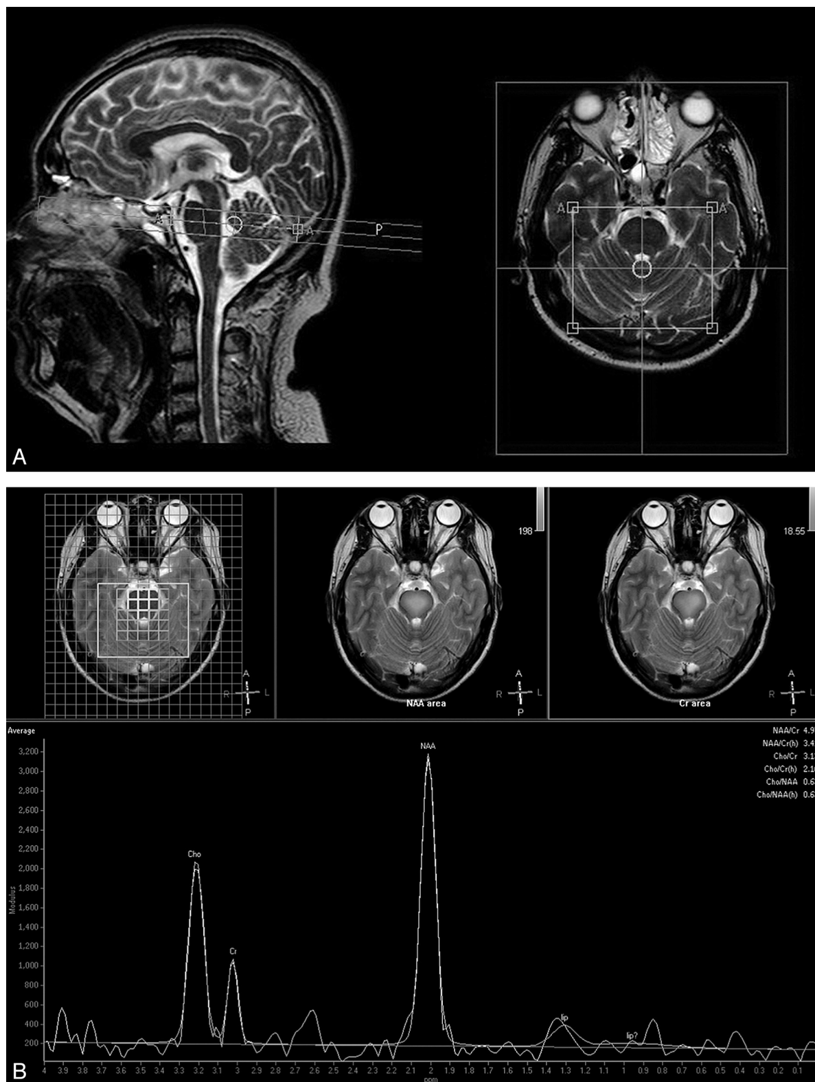
FIG 1. Positioning of the pons TSI scan and spectrum data processing. A , T2-weighted images show the placement of volumes of interest in the pons. The left side is sagittal, and the right side is transversal. The TSI was positioned parallel to the frontal cranial fossa. Note that the box is the signal-generating area. B , The upper row of images shows the region-of-interest selection area, and the lower image shows the reconstructed average metabolite ratios of the region of interest.

for MR spectroscopy because it requires a uniform magnetic field. The TSI technique used in this study provides a solution to the above problems. Unlike ordinary MR imaging techniques that