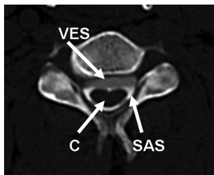
FIG 2. Axial postmyelogram CT through the cervical spine demonstrating ventral epidural contrast collection. SAS indicates subarachnoid space.

nuclide CSF study by using indium-111 diethylene triamine pentaacetic acid was subsequently ordered to further localize the site of leakage but revealed no CSF leak. Neurosurgery was consulted, but given the large size of the fluid collection and unknown exact location of dural injury, it was thought that exploring the ventral spinal column would require a morbid surgery and extensive vertebrectomies. A consultation for possible EBP subsequently occurred.