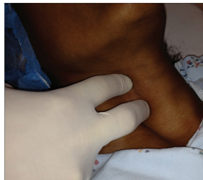
FIG 3. Demonstration of the technique of digital palpation of the neck and manual displacement of critical structures such as the common carotid artery. The right side is generally preferred because the esophagus usually descends left of midline.

Given the estimated size and ventral location of the CSF collection, it was decided to attempt an anterior EBP approach. The patient was placed supine on the fluoroscopy table. Following sterile anterior neck preparation and conscious sedation with vital sign monitoring, the C5-C6 disk space was identified by using frontal fluoroscopy. Local anesthesia was provided with 1% lidocaine. The patient was instructed to relax the muscles of the neck and shoulders, as gradually increasing digital pressure over the