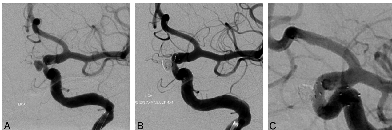
Fig 2. Frontal views of DSA of the left internal carotid artery, showing a 5.5-mm SHA aneurysm pointing medially in a 36-year-old woman (A). The aneurysm was successfully embolized by using a stent-assisted technique (B) and progressed to complete occlusion on the 6-month follow-up angiogram (C).