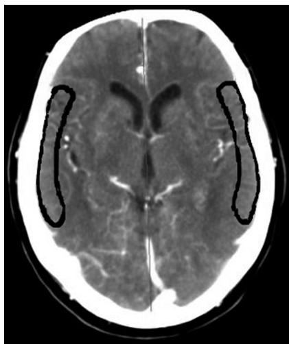
Fig 1. Manual outlining of middle cerebral artery territory on transverse CT sections, according to the maps of Damasio. 20

paired t test and the Wilcoxon signed rank test for 2 related samples. Subsequently, we analyzed differences between symptomatic and asymptomatic patients for both pre- and posttreatment values by using the Mann-Whitney U test for 2 independent samples. Statistical analysis was performed by using the Statistical Package for the Social Sciences, Version 15.0 (SPSS, Chicago, Illinois). A P value < .05 was considered statistically significant.