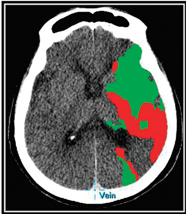
Fig 1. A 75-year-old patient with a left MCA ischemic stroke. Prognostic PCT map shows a mixed pattern of infarct core (red) and penumbra (green).

risk that was seen with the first-pass acquisition without delay correction (Table 2).