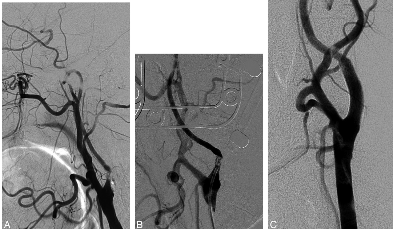
Fig 1. NO of the left ICA. A , Reduced ICA diameter compared with the external carotid artery. Retrograde filling of the supraclinoid segment through the ophthalmic artery. B , Multichanneled NO of the ICA. C , ICA angiogram after stent placement.

(Boston Scientific/Target Therapeutics, Fremont, California) in 26 (22.4%), and EPI FilterWire (Boston Scientific/Target Therapeutics) in 5 (4.3%). In 20.7% of patients, the procedure was performed with rapid exchange (monorail) systems without distal protection. In 5 cases, distal protection was not used because the artery did not recover after predilation a caliber higher than 2 mm, that diameter being the minimum acceptable for display. In the other 19 cases, we were unable to cross the thigh stenosis with the protection system, even after predilation.