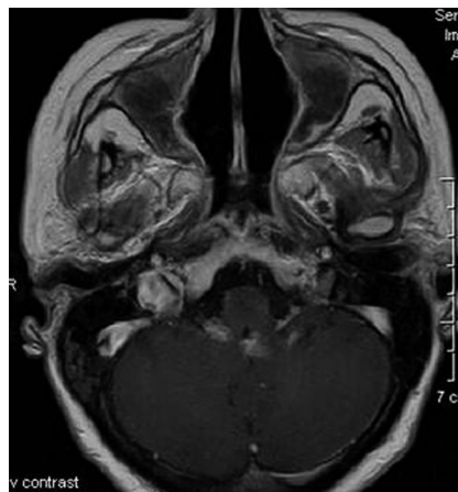
Fig 2. Control MR imaging examination, which was performed after 20 days of treatment, demonstrates regression in both nodular-enhancing lesions (the largest was 10 mm in diameter) in an axial T1-weighted contrast-enhanced sequence.