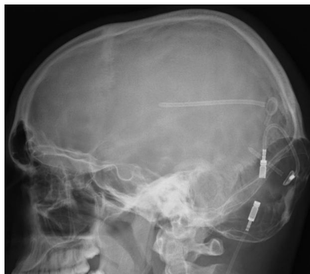
Fig 2. Lateral skull radiograph performed in our patient at age 15 years shows development of intradiploic cyst of the occipital bone.

and the expansion of the diploic space extending from the supraoccipital into the basioccipital part of the occipital bone, including the occipital condyle and lower clivus (Fig 3).