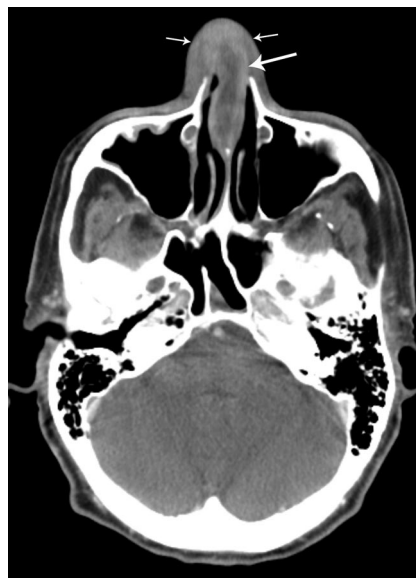
Fig 1. A 76-year-old man with acute myelogenous leukemia. CT imaging through the nasal cavity demonstrates a thin-walled, cystlike collection with peripheral enhancement involving the cartilaginous nasal septum ( large arrow ) consistent with a nasal abscess. There are no associated solid components. Note the swelling of the adjacent nasal soft tissues ( small arrows ).

Patient 2 was a 17-year-old adolescent boy with a history of T-cell lymphoblastic lymphoma in complete remission. The patient was on chemotherapy consisting of modified hyper-CVAD (fractionated cyclophosphamide, vincristine, Adriamycin, and dexamethasone). The patient reported a recent history of minor nasal trauma and complained of frequent blowing of the nose secondary to allergic rhinitis, and nasal tenderness for the previous 2 to 3 days. On clinical examination, there was a mild amount of edema and erythema over the dorsum of the nose with mild tenderness and the presence of a saddle deformity. The white blood cell count was elevated to 13.1 K/UL. Fiberoptic examination of the nasal cavity was performed, which re-