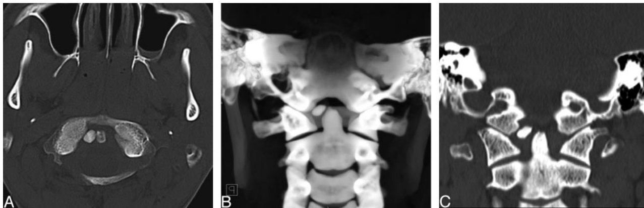
Fig 1. A previously healthy 24-year-old man was involved in a traffic crash and presented with severe craniocerebral injuries.

A, Initial axial CT scan shows a nodular calcification between the odontoid tip and the right occipital condyle, suggesting a fractured bone in the craniocervical junction.