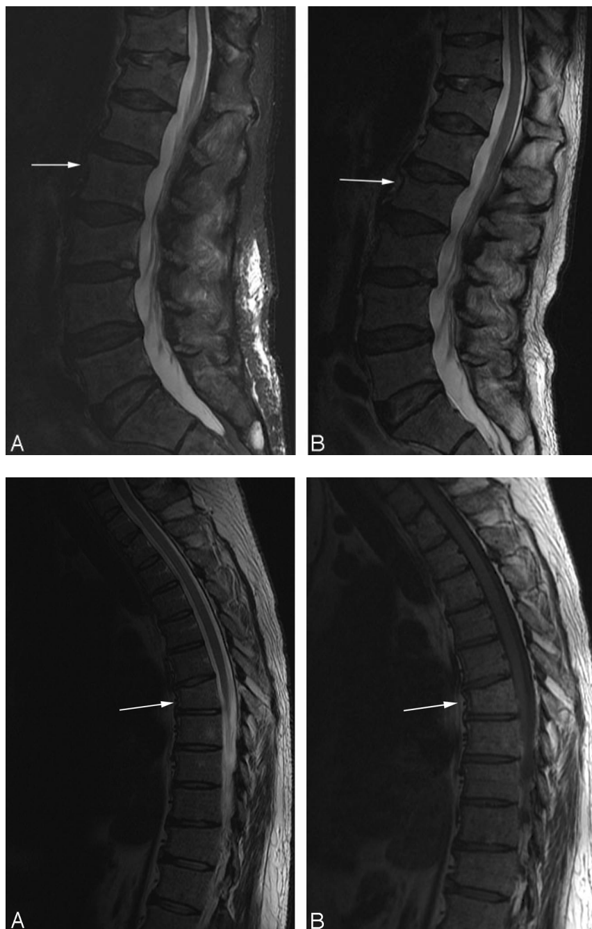
Fig 1. A, A 64-year-old man with multiple myeloma. Sagittal T2-weighted MR image demonstrates several mild lumbar compression fractures with a normal appearance of L2 (arrow).

B, A follow-up sagittal MR image obtained 4 weeks later demonstrates a new compression fracture of L2 (arrow) without any associated edema.