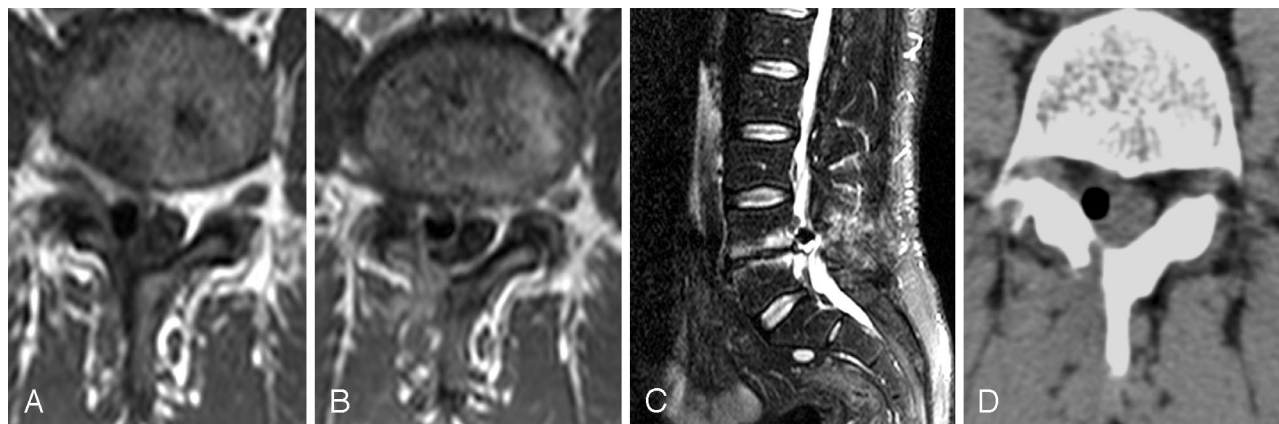
Fig 3. Postoperative axial and sagittal MR images of lumbar spine before and after administration of intravenous contrast media and noncontrast axial CT scan.

A, An axial T1-weighted (TR, 477; TE, 14) MR image shows a signal void gas accumulation in the right anterolateral epidural space compressing the dural sac and displacing the right L5 nerve root to the posterior.