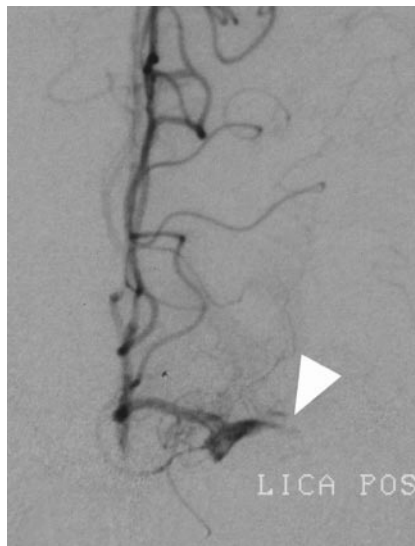
Fig 2. Left ICA angiogram (performed through indwelling microcatheter), frontal projection, following administration of abciximab demonstrating persistent occlusion of the left M1 segment (arrowhead).