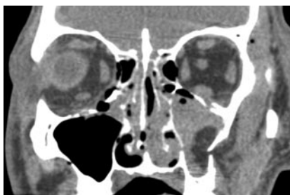
Fig 2. Case 2. Coronal reformatted CT image shows the buccal fat pad herniating into the maxillary antrum via a fracture of its lateral wall on the left. There are fractures of both orbital floors, the lateral wall of the right maxillary antrum, and the medial wall of the left maxillary antrum. Other images (not shown) disclosed fractures across the bridge of the nose, fractures of the lateral walls of both orbits, and fractures of both inferior orbital rims.