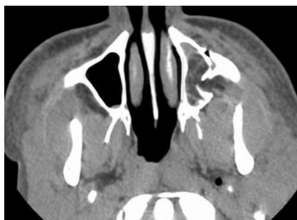
Fig 1. Case 1. Axial CT image reveals fractures of the lateral and anterior walls of the left maxillary antrum. Herniation of low attenuation fat into the maxillary sinus is evident. The lateral maxillary antrum fragments form a "flap valve" trapping portions of the buccal fat pad within the antrum. Note a minimally displaced fracture of the left lateral pterygoid plate. Other images (not shown) demonstrated minimally displaced fractures of the left lateral orbital wall and left zygomatic arch.