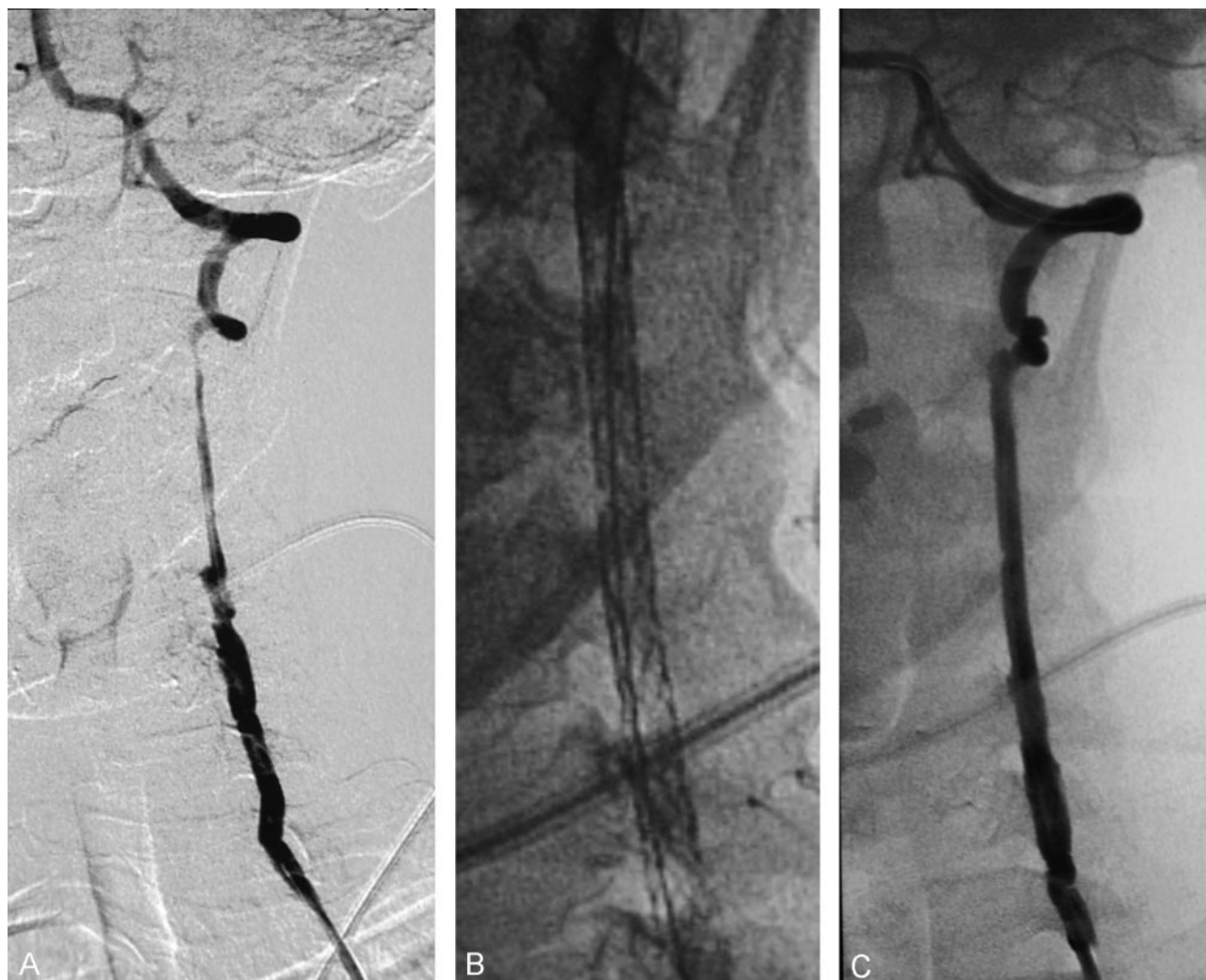
Fig 1. Angiography of the cervical left VA reveals a multiple and irregular subintimal dissection with associated pseudoaneurysms extending through the cervical segment (A, left). Magnified radiographic view of the implanted stents (B, center). Angiography of the reconstructed artery (C, right).

end of the dissection. The balloon was inflated up to the maximum recommended pressure to deploy and implant the stent into the inner arterial wall. Then, two 3.5 \times 12 mm balloon-mounted stents (AVE inx, Medtronic AVE) followed by four BX Sonic stents (Cordis Neurovascular), ranging 3.5 to 4.5 mm in diameter by 12 mm length were sequentially implanted until complete reconstruction of the vessel was achieved (Fig 1 A–C).