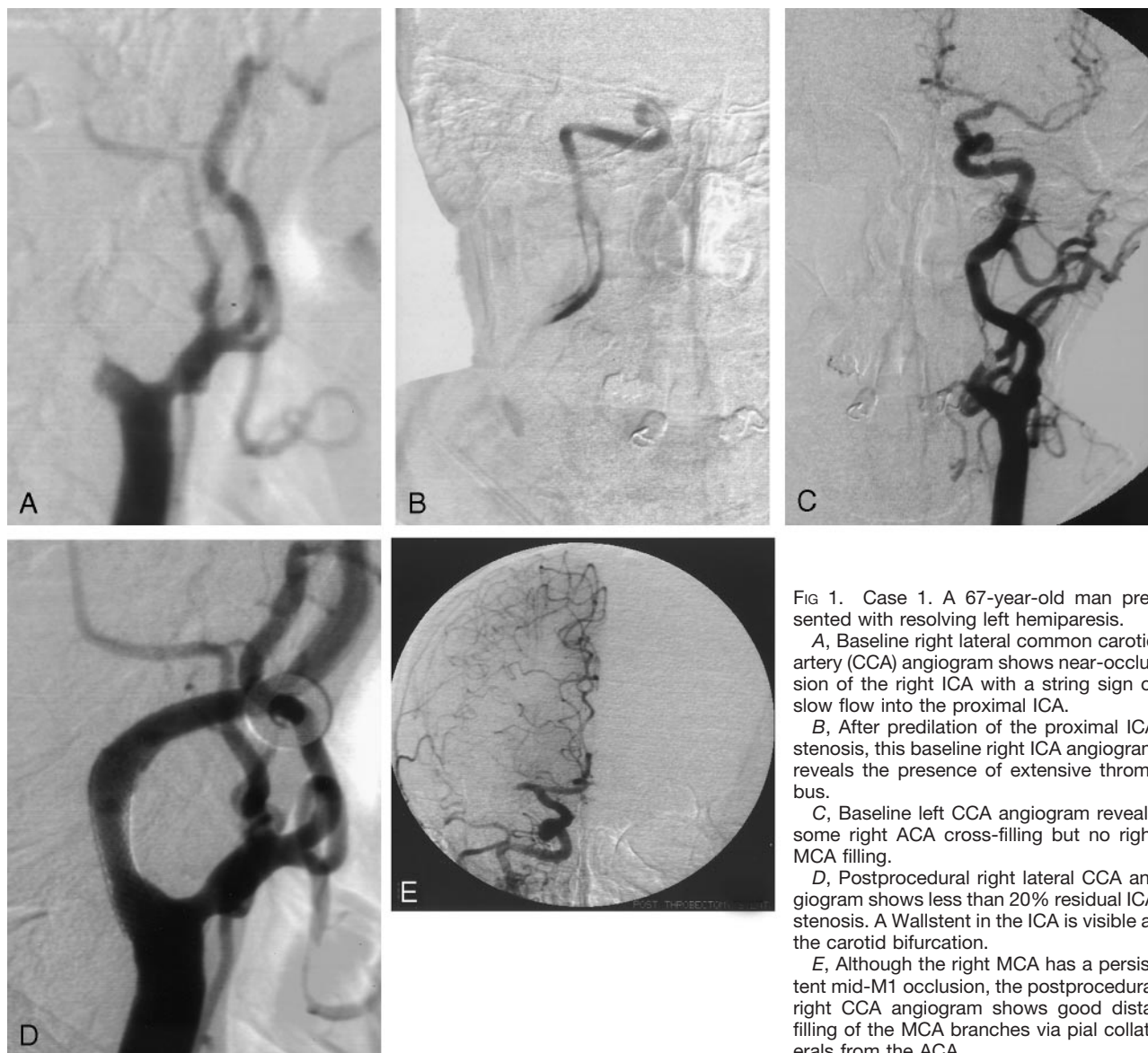
FIG 1. Case 1. A 67-year-old man presented with resolving left hemiparesis.

† Patient had a concurrent foot infection that limited his walking.