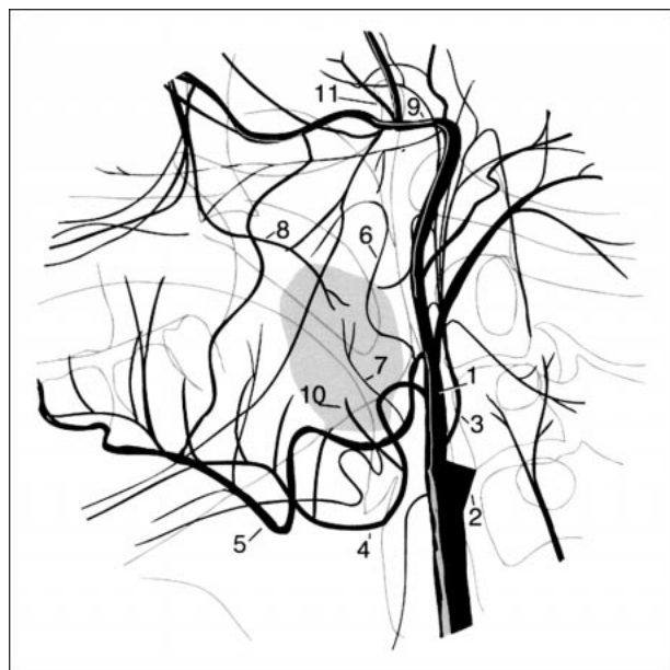
FIG 3. Drawing shows major arterial supply to the palatine tonsil and adenoidal area. 1, ECA; 2, ICA; 3, ascending pharyngeal artery; 4, lingual artery; 5, facial artery; 6, ascending palatine artery; 7, tonsillar artery; 8, descending palatine artery; 9, internal maxillary artery; 10, dorsal lingual artery; 11, accessory meningeal artery.

to surgical technique (2). Our patient with secondary PTAH presented to our hospital 14 days postoperatively. A number of factors have been suggested as increasing the risk of secondary PTAH, including elevated postoperative mean arterial pressure, excessive intraoperative blood loss, older age, a history of chronic tonsillitis, and use of nonsteroidal anti-inflammatory drugs (4, 10).