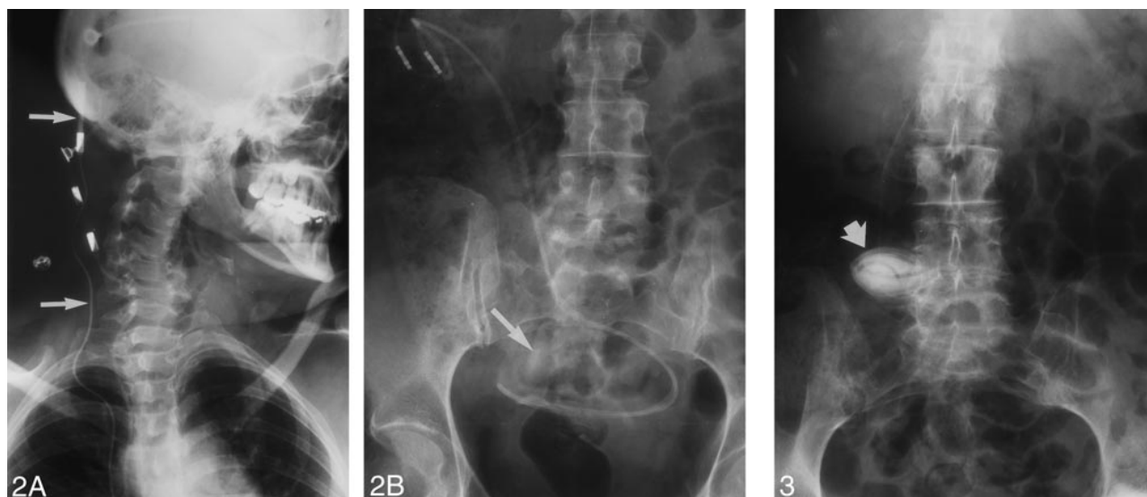
FIG 2. Patient 2 (with a Cordis Unishunt system).

A, 12-minute film at the level of the valve shows contrast material in one of two ventriculoperitoneal shunts but no forward motion of contrast agent (arrows). Shunt flow at this point is abnormal.