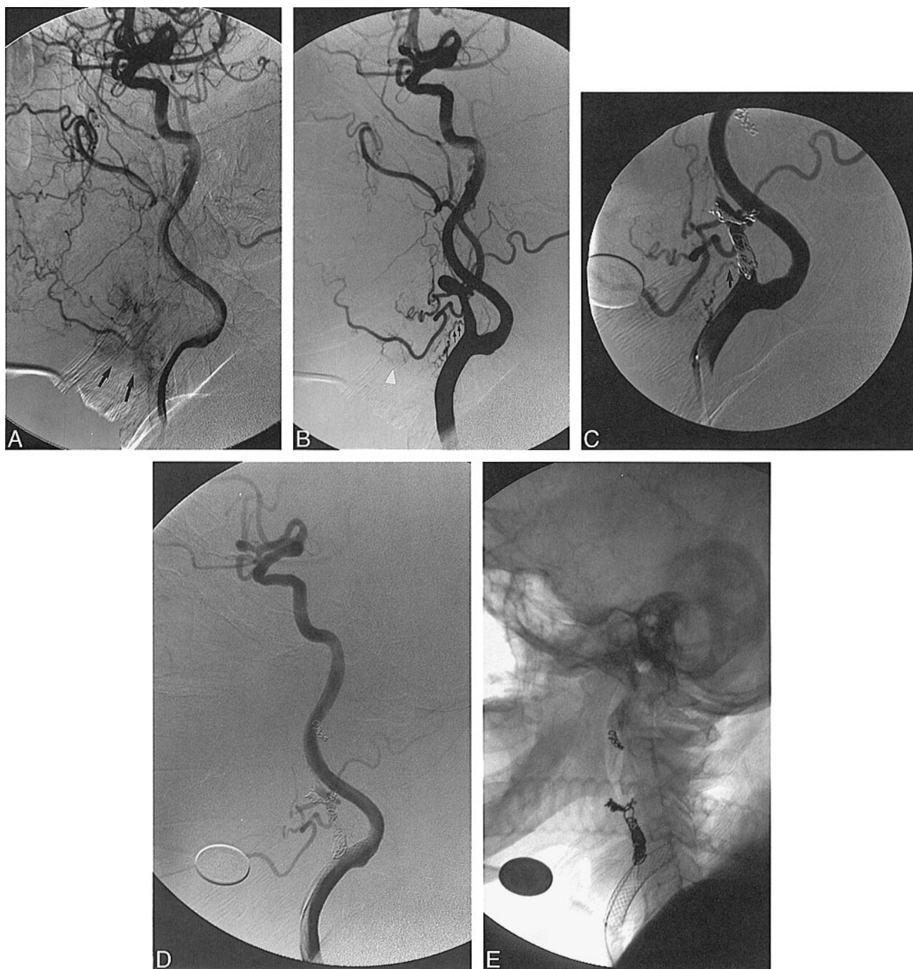
FIG 3. 65-year-old man with recurrent squamous cell carcinoma of the neck surrounding the ECA branches who presented with significant oropharyngeal bleeding.

A, Lateral view from late arterial-phase right CCA angiogram shows vascular tumor blush ( arrows ) corresponding to recurrent neck tumor.