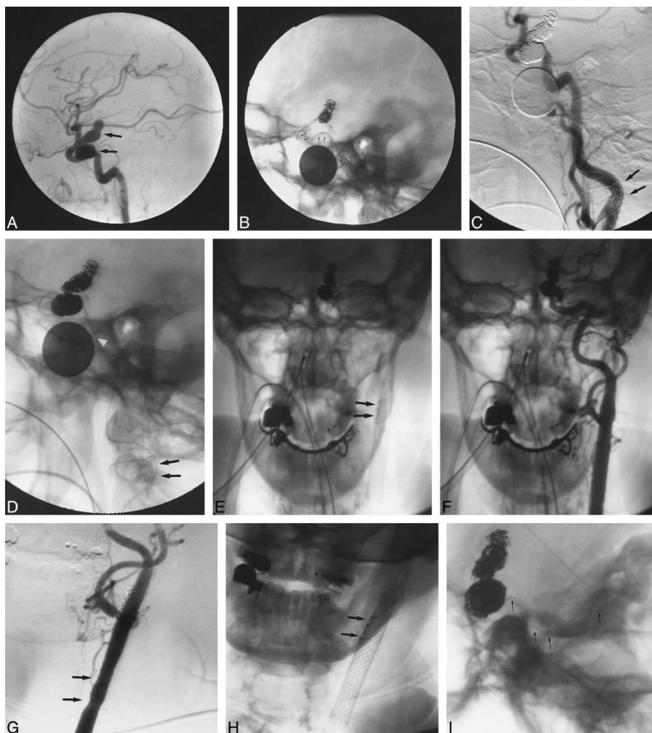
FIG 1. 63-year-old woman (with a Hunt and Hess grade of 4) who had subarachnoid hemorrhage from ruptured aneurysms of the left posterior carotid wall.

A, Lateral view from left ICA angiogram shows two large posterior carotid wall aneurysms (arrows), one of which is bilobate.