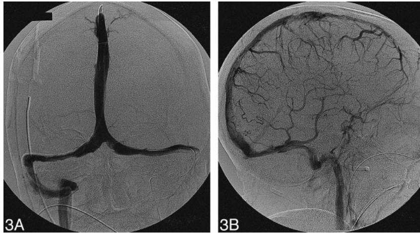
FIG 3. A, Injection of catheter within superior sagittal sinus demonstrates that, after clot removal from superior sagittal sinus and transverse sinuses, flow was resumed and little evidence of residual thrombus was present.

B, Over-the-wire Fogarty catheter is present in superior sagittal sinus (arrow).