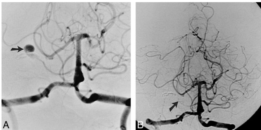
FIG 3. Case 2: angiograms show partially clipped aneurysm treated with short Guglielmi detachable coils.

B, Arterial phase of angiogram after treatment shows parent vessel occlusion by coils (arrow).