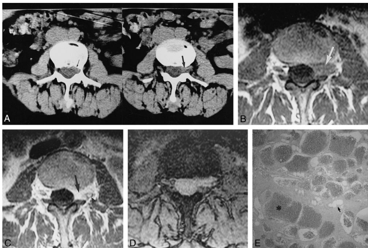
FIG 1. Case 1: 51-year-old woman with low back pain and right-sided sciatica for 6 months.

A, CT scan of the lumbar spine shows a left-sided ventrolateral extradural mass isodense with respect to the intervertebral disk extending through the left foramen ( wide arrow, right ) and slightly eroding the posterior wall of the L3 vertebral body ( thin arrow, left ).