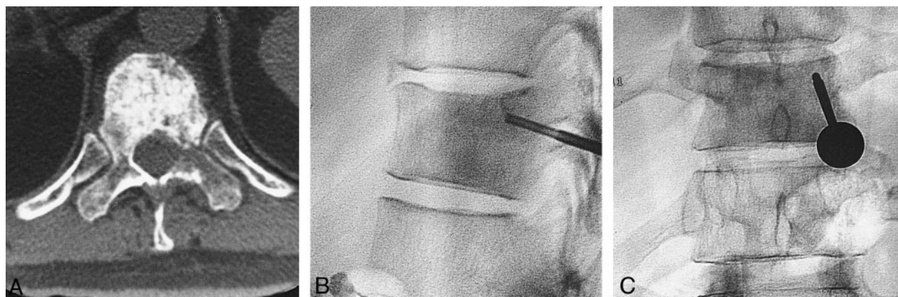
FIG 2. Percutaneous transpedicular biopsy at the thoracic (T11) level.

Indications for using either the posterolateral or transpedicular approach depend on the location of the lesion. If the lesion is located predominantly in the disk space, as in cases of infectious disease, the posterolateral approach should be used. This approach is also mandatory when a lesion is located in the lower part of the vertebral body; however, if the lesion is located in the posterior half of the vertebral body or if the pedicle is involved, the transpedicular approach is an effective method of