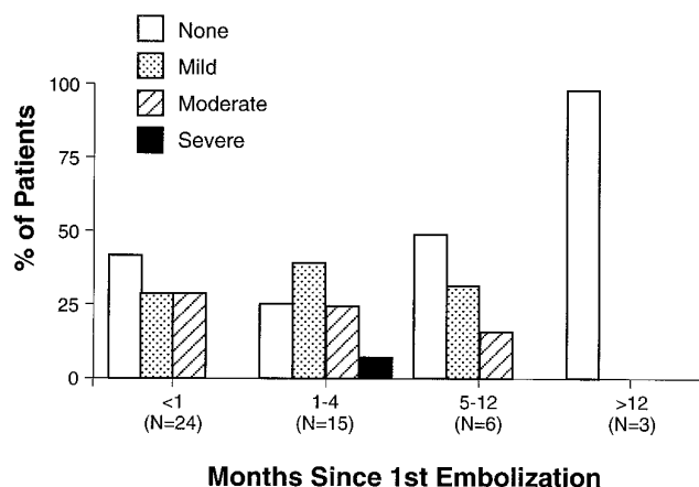
Fig 2. Histologic analysis of perivascular inflammation.

Histopathologic evidence of perivascular inflammation was absent or mild in 35 cases (73%) (Fig 2). Perivascular inflammation was only observed in specimens from AVMs resected 12 months or less after the first embolization. No obvious difference in severity was