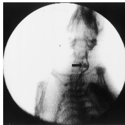
Fig 3. Fluoroscopic C-arm left common carotid arteriogram of animal 2. Arrow indicates experimentally created aneurysm.

Angiography. —Angiography was performed in 13 of 15 elastase-perfused sacs 2 weeks after surgery. In 92% (12 of 13) of the cases, the angiographic study with C-arm fluoroscopy (Fig 3) revealed a patent common carotid an-