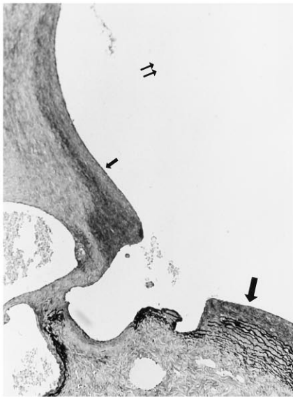
Fig 1. Histologic longitudinal cross section of aneurysm created in animal 3. Large arrow indicates parent artery with intact elastic lamina; small arrow , aneurysmal wall with absent elastic lamina; and double arrows , patent aneurysmal lumen (hematoxylin-eosin and orcein stain).