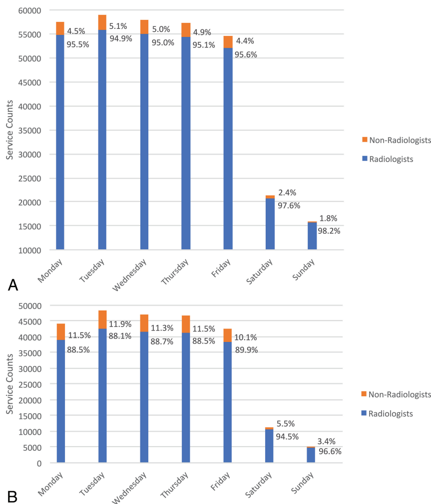
FIG 1. Breakdown of service counts by radiologists versus nonradiologists as billing providers in a 5% national sample of Medicare fee-for-service beneficiaries from 2012 through 2014 by day of week for brain MR imaging (A) and lumbar spine MR imaging (B) examinations.

weekend. Of lumbar spine MR imaging performed on weekdays, radiologists interpreted 203,006 (88.7%), while nonradiologists interpreted 25,740 (11.3%). For lumbar spine MR imaging performed on weekends, these proportions shifted to 15,582 (95.1%) by radiologists and 798 (4.9%) by nonradiologists (Fig 1B).