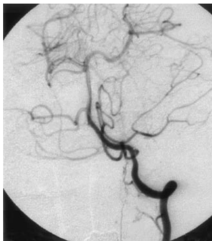
FIG 4. Left vertebral angiogram (early phase), showing abnormal vessels at the cervicomedullary junction. The feeder, the anterior spinal artery, feeds directly into the lateral medullary vein (arrow).