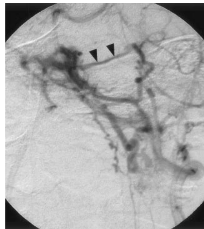
FIG 3. Postoperative left vertebral angiogram, demonstrating complete disappearance of the abnormal vessels.