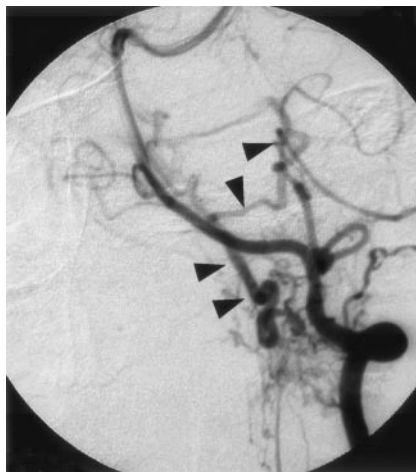
FIG 2. Left vertebral angiogram (late phase), showing shunt flow draining retrogradely into the left superior petrosal sinus (arrowhead).