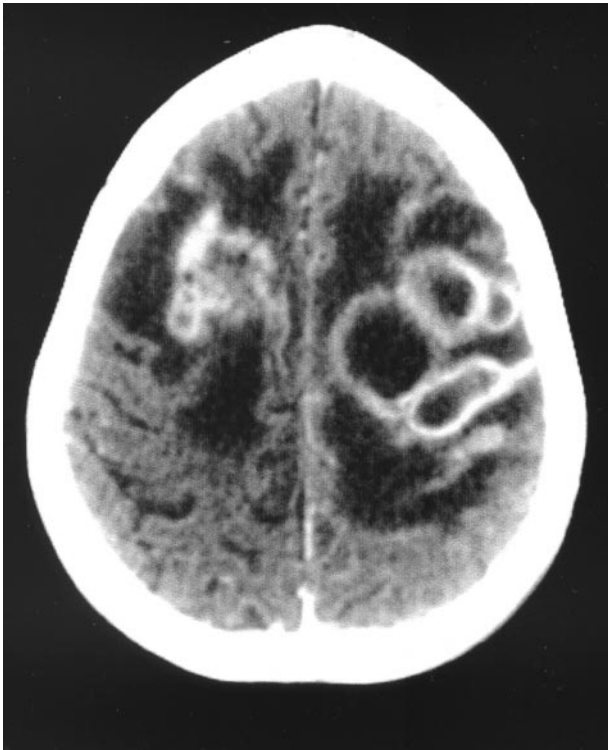
FIG 1. CT scan of the brain obtained on day 29, after the IV administration of contrast medium, shows multiple enhancing ring-shaped lesions, consistent with abscesses in both hemispheres, with marked peripheral hypoattenuation, consistent with edema.

intracranial aneurysms, documenting a massive destruction of the elastic lamina of the arterial wall (14). Although it has been pointed out that P. boydii , like