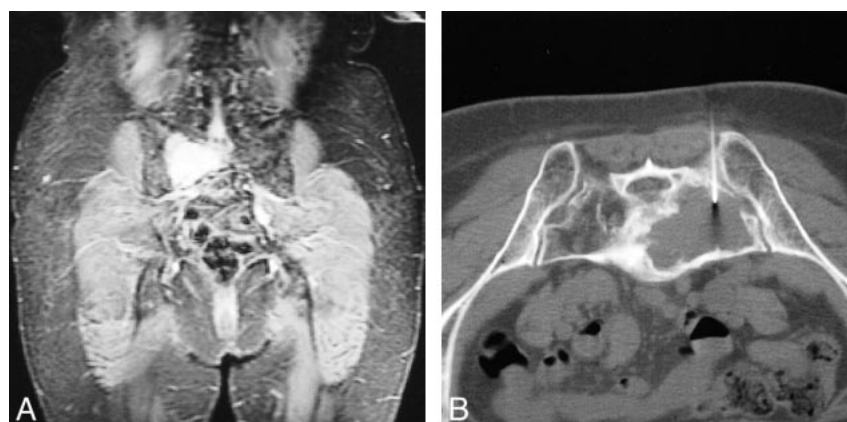
FIG 1. Sacral plasmacytoma in a patient in the TT II trial. A, Coronal STIR T1-weighted image shows a large hyperintense plasmacytoma in the right sacral ala. B, CT-guided FNA of a large lytic lesion shows cytogenetic abnormalities, including chromosome 13 deletion.