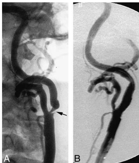
FIG 4. Ipsilateral oblique views of the left carotid artery.

A, Severe short-segment, circumferential, atherosclerotic stenosis of the internal carotid artery origin (arrow).