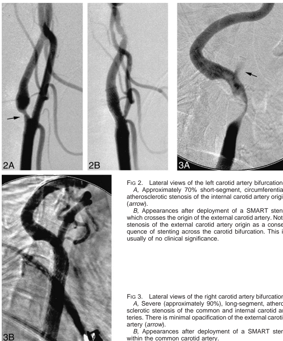
FIG 2. Lateral views of the left carotid artery bifurcation.

A, Approximately 70% short-segment, circumferential, atherosclerotic stenosis of the internal carotid artery origin (arrow).