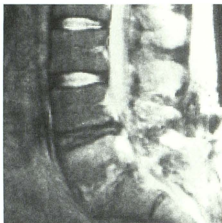
Fig. 2.—Sagittal MR scan, 2100/90 (TR/TE), shows destruction of L5-S1 endplates, with areas of hyperintensity adjacent to endplate.