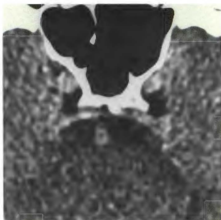
Fig. 2. —Large cavernous sinus fat deposits in a patient with Cushing disease.

ous sinuses and no clinical evidence of Cushing disease as the only criterion. It was thought that this would best reflect